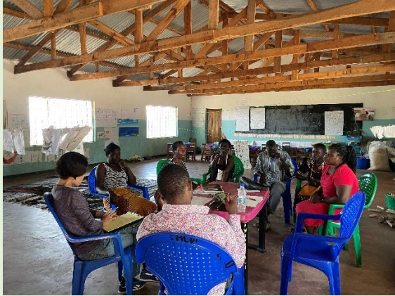
Meeting with CPW and caregivers

There is a Child Protection Worker (CPW) in each community area. The Child Protection Worker's job is to monitor the children in the community. She also monitors CBCC once a month.