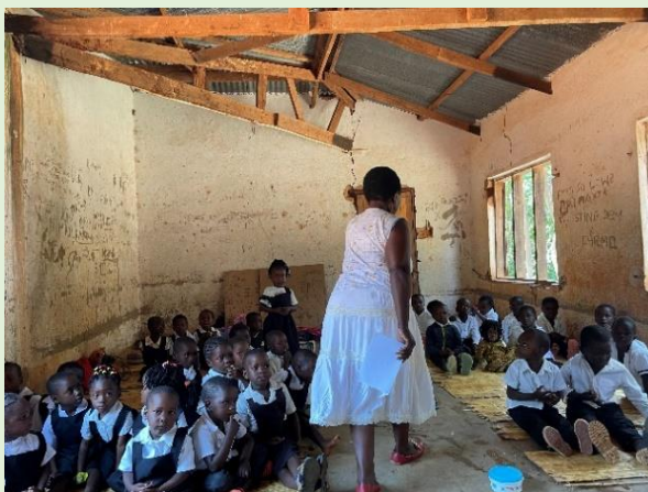
Caregivers tell to children to sit down

Facility A was established in 2012 in a community building. It is located in an area that is a 30-minute walk from the town center and a 20-minute walk from the nearby primary school. It is open from 8:00 am to 12:00 pm. Two caregivers operate it and serve 47 children aged 2 to 5. MK1,000 (about $0.8) per month is collected from the children to cover the cost of paper and printing for tests and report cards. The community is inactive, so they think they need support from the community. Active caregivers manage the facility. We look forward to future progress.