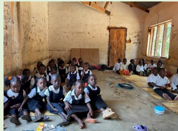
Children listening to caregivers