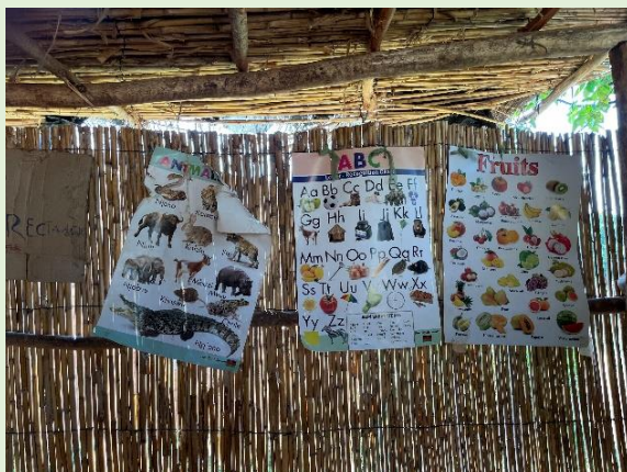
Studying materials (Animals, alphabet, and fruits)