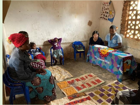
Interview to CPW