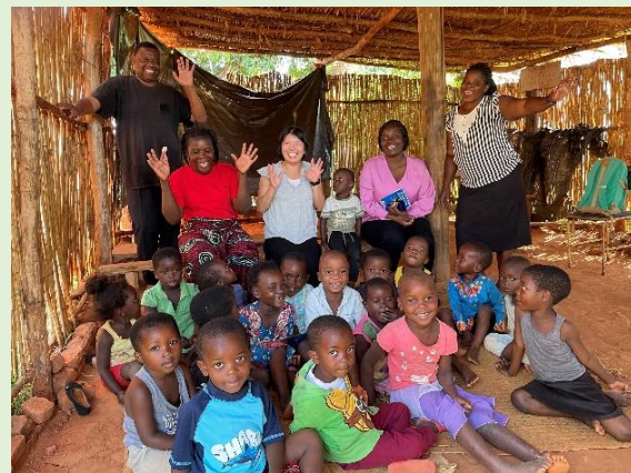
Government officers, caregivers, and children