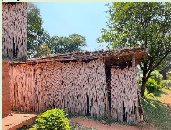
The facility was built by community

Facility B was just built in 2021 with community support. It is located in an area that is a 45-minute walk from the town center. It is open from 8:00 am to 12:00 pm. It is operated by three caregivers, and 35 children aged 3-5 attend the school. The facility does not collect any money from the children and is free of charge. There are ten community members. They conduct a meeting once a month. Enthusiastic caregivers manage the facility by obtaining community support. We look forward to seeing further progress.