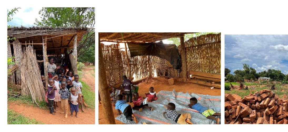
Facility Free time Land for building new facility