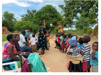
Conduct health check