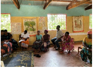
Discussion with community